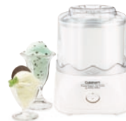
Ice Cream Makers

Cuisinart offers an extensive assortment of top quality products to make life in the kitchen easier than ever. Try some of our other countertop appliances and cookware, and Savor the Good Life®.