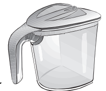
MR. COFFEE® TP50 Replacement Pitcher